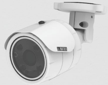
SATATYA MIBR20FL28CWS 2MP IR Bullet Camera with 2.8mm Lens

Matrix Professional Series IP Cameras are built using superior components such as Sony STARVIS sensor and higher MTF lens to offer unmatched image quality especially during the low light conditions. Powered by True WDR algorithm, these cameras offer consistent image quality even in highly varying lighting conditions. Built in intelligent analytics including Intrusion Detection, Trip Wire, etc. ensure real-time security. Moreover, H.265 compression and Automatic Motion based Frame Rate Reduction save bandwidth and storage up to 50%.